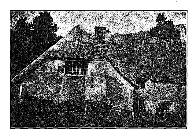
Loughwood in Dalwood, Built 1655.