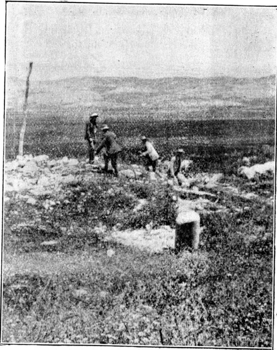
THE SITE OF JACOB'S WELL.

About six months ago a new Greek abbot took charge of the property, and at once set to work to preserve the site in a manner that will materially benefit his community, and at the same time save it from the ruin that would soon have lost us one of the most authentic sites of the Holy Land. The ground was cleared and excavated on the northern side, where a flight of steps was found leading to the vaulted chamber that was formerly approached with great difficulty through an opening in the earth above. This has been closed, and the chamber over the well