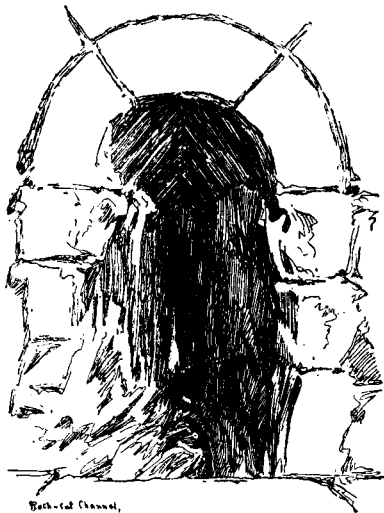
Beth-el Channel, and Stone-roofed Conduit Solomon's Pools. W. Simpson March 1867.