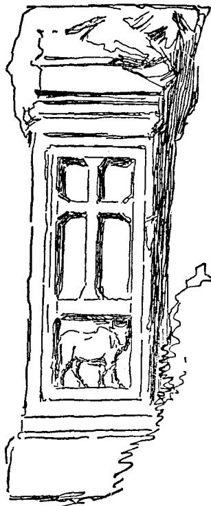
PILASTER, WITH CROSS AND BULL; EPHESUS.

vol. ii. p. 224). He thus describes it: "The lower part of the chamber is, as I have already stated, built of blocks, and is pierced with openings, which radiate like embrasures from the centre of the chamber to the outside of the basement. There can be no doubt but these passages were intended as receptacles for bodies. Such an arrangement of cells, or θηκαι , branching out from a principal chamber, may be seen in Hellenic tombs at Budrum, and at Pyli, in the island of Cos. I have never, however, before met with the circular arrangement adopted here." It will be noticed that there is a slight difference between the monument at Cnidus and the one at Ephesus—the first has a central chamber,