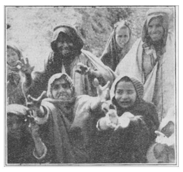
IMPS OF IMPORTUNITY

NE of the persons that I feared the most in the East was the beggar, because once he began to pester you with his demands he never left you for a moment until you gave in Silent beggars who set forth their claims upon boards hung about their necks are unknown there These clamorous, persistent, importunate bundles of rags, scream out their needs, pour forth their woes, disclose their diseases, and parade the wounds of their leprous condition in a way that fills one with horror. They beg, they demand, they scream, they hunt you from one bazaar to another, and the only thing that they will not do is to be quiet, or leave you to go your way in peace. Say "No," with all the firmness that you can command, but they do not know the meaning of the word Refuse their claims, they will pop up at the next stopping place and thrust their leprous hands before your eyes There is no escape