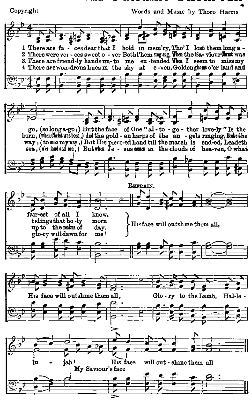
Do not cut this out. The music appearing in this paper will be published later on in book form