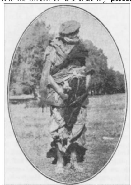
" SAINT SELF-RIGHTEOUSNESS "

OME people collect furniture, others make a hobby of china, but this gentleman was a connoisseur of rags. I met him soon after my arrival in the north of India, and, while prepared for the cry of poverty, was hardly ready to find rags were a virtue. His highness of the rag-bag was stinking with pride, and when I drew closer to get a better view he informed me that my person was an