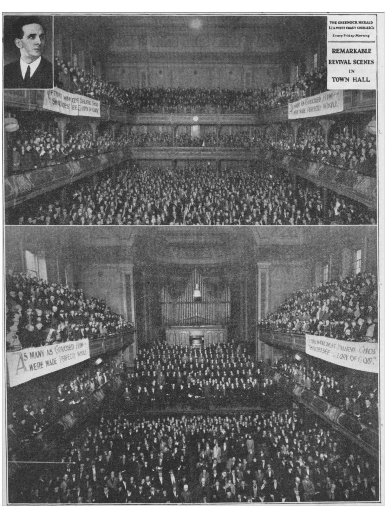
The great crowds at Principal George Jeffreys' Revival Meetings at Greenock. Top: view from platform Bottom view from boxes