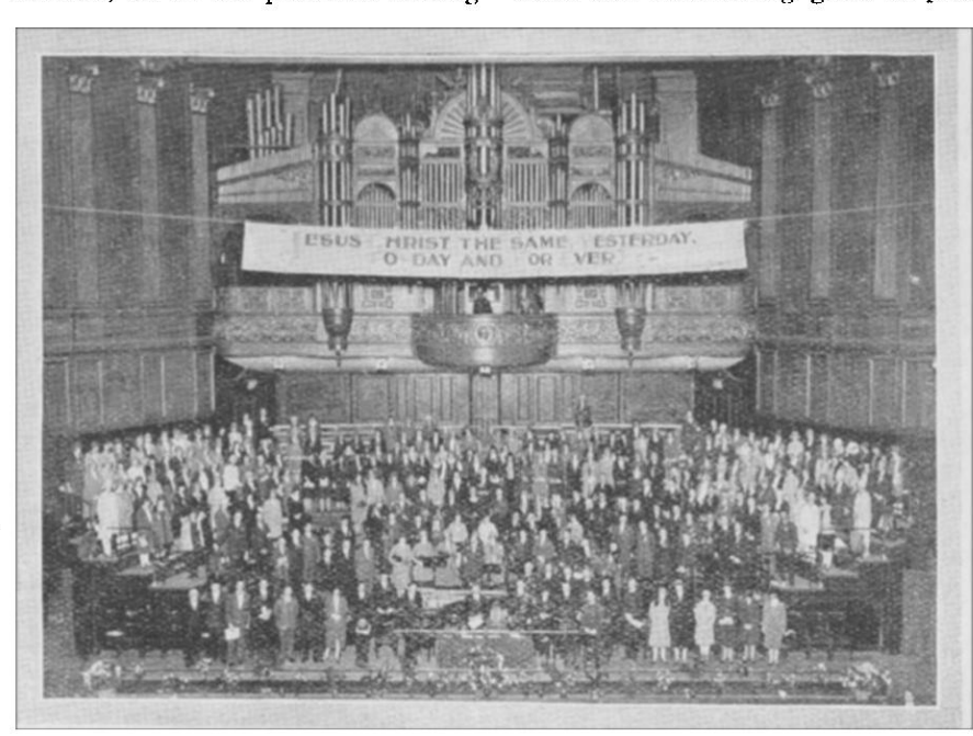
The platform scene at the Queen's Hall, London, on Thursday evening.

trionic blasphemy was being staged in Piccadilly-the Judgment Day dance. The modern masked ball at its best shows that only a narrow margin separates the average society habitué from the psychology of his childhood. In this particular instance the fertile search for a new stage-game led the child-psychology into a caricaturist mockery of events which must one day shake the universe. The naticinatory folly at Weymouth, the attitude of the daily press toward eternal things in general, and the spiritual slumber of the gay and preoccupied and titude, impress us afresh with our Lord's urgent charge to fulfil His commission, entrusted to us for the generation which His Word declares shall witness the unveiling of His glory in the very heavens.