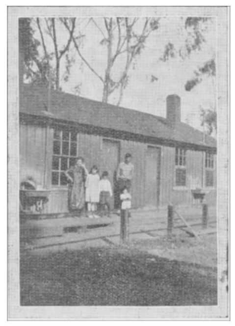
A Mexican Family outside their home

With this the power of the Holy Spirit came upon her, and she began to speak in another language. She was speaking in Japanese, and telling the poor cripple that God could heat him. By this time some younger members of the family came in and heard her speak and asked her where she had learned to speak Japanese, as she spoke their language perfectly.