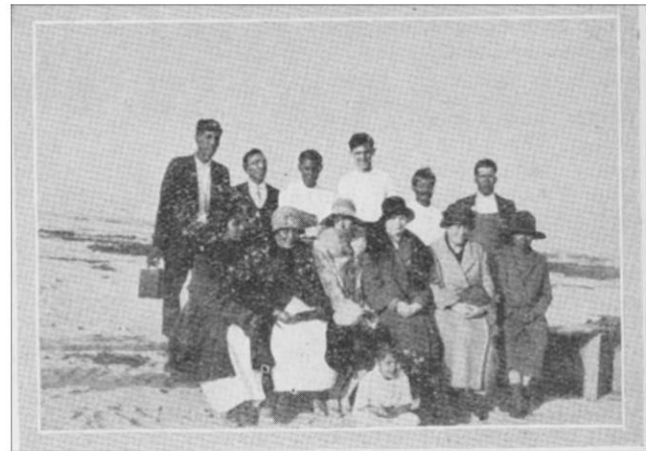
A BAPTISMAL SERVICE

It was pathetic to watch the faces of the men and women as their money changed hands, and they watched with strained faces the throwing of the dice or the revolving of the disc, and when they saw that they had lost, they would give a little gasp or make some other gesture which shewed their keen disappointment, and which to us shewed how fast they were in the grip of the Evil One.