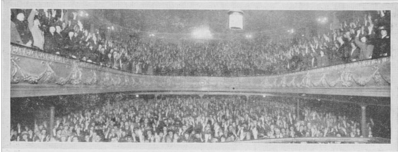
SALEM CENTRAL HALL, LEEDS,

The knee which seemed destroyed and would never bend again is bending beautifully, and the leg which was so wasted is gaining, and already there is a big improvement.