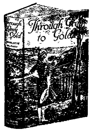
" RED CORD " SERIES

The World's Unrest. Visions of the Dawn By Chrisabel Pankhurst, LI B 5s net (by post 5s 6d)