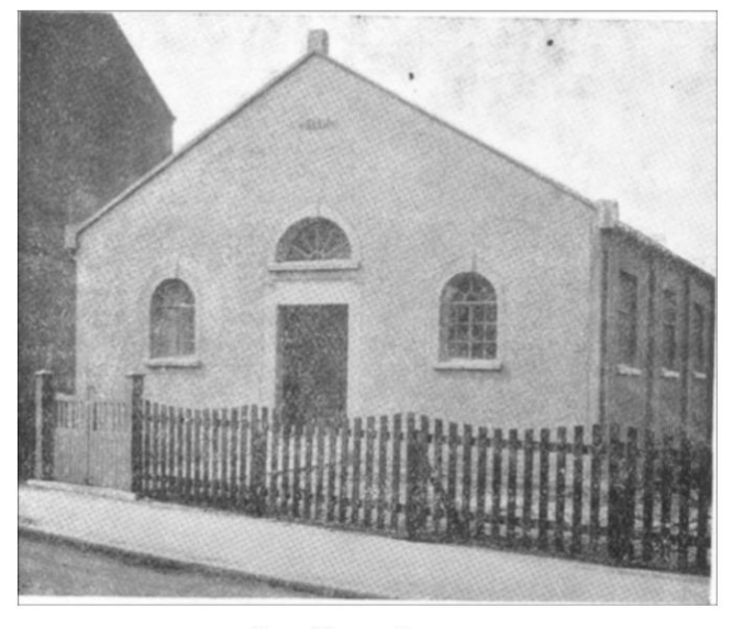
ELIM HALL, BANGOR

of the battle of the Boyne, when all the Orangemen of Ulster were aglow with enthusiasm to beat their drums and blow their bugles in the celebration of that memorable victory. But they were not that day the only enthusiastic ones, whose hearts were aglow in the celebration of a great and glorious victory. The people of the Elim Assemblies in the North of Ireland looked forward to the day, when they could meet together and praise their great and wonderful Leader—the King of kings and Lord of lords—in the realisation of a greater victory than that of the battle of the Boyne, even in the realisation of a victory over the combined hosts of darkness.