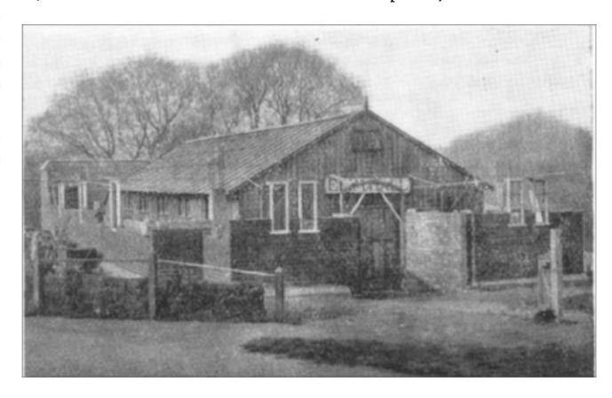
ELIM HALL, LETCHWORTH The above photograph shews the new brick building being erected round the present hall. When the new building is completed, the half inside will be dismantled and taken out the front door.

and from that time, she says, I went no more out The crowds of people served only to draw me into deeper religious recollection. The noise of the streets only augmented my inward prayer. Her friend, Archbishop Fenelon, also demonstrates the essentiality of inward silence to true inspiration. "We are always inspired," he says "but we incessantly stifle the inspiration. God does not cease to speak, but the noise