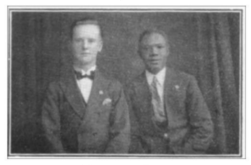
BLICK AND WHITE Two Flim Crusaders

In view of this fact it may be profitable to read part of the chapter as it is given in the translation of the Old Testament made by Jewish Rabbis in 1916 and issued by the Jewish Publication Society of America. For this Version a large group of men representative of Jewish learning among English-speaking Jews are responsible, and it is claimed by them that every possible effort was made to secure the most perfect accuracy in the text