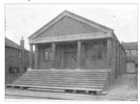
The above is a photograph, when nearing completion, of SALEM TABERNACLE, COLISION

Faith in Jesus Christ, he said, saved men from their sins, sinctified them, and he iled them of physical ills. He believed in Divine Healing, because God in His Word had declared Himself to be the healer of His people. He had experienced this healing himself, and when Christ commissioned men to preach the Gospel, He also commissioned them to heal diseases. Further, he had witnessed God's power to heal, even when all human skill had failed. As God worked in days of old, He still worked to-day.