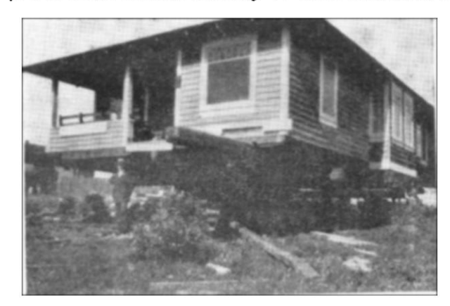
The new nome being lifted off the foundations, and moved further back to make room for the new church

"The house in which we are now living has been taken over as a home for the nussionaries who are working among the Mexicans in this part. It is just a small wooden building of three bedrooms, a