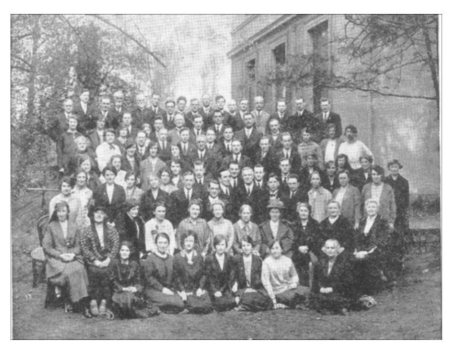
A GROUP OF VISITORS TO THE ELIM WOODLANDS, CEAPHAN (the home of the Elim Bible College) during our Easter Convention, 1926 Visitors are welcomed for the summer holidays