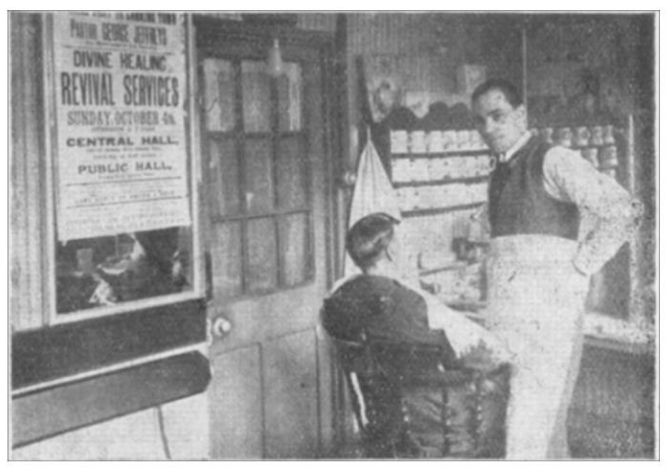
ONCE A GAMBLING DEN-NOW A BETHEL (One of the many results of the East Ham Town Hall Revival)

healing Not only for cancer, but also double rupture The pastor asked me if I believed the Lord could heal me, and I sord, "yes." Then he said, "Ask Him to," and I prayed Then he placed his hands on me and prayed, when I fell backwards with the power of God, and when on my back a inshing wind passed up and down my stomach three times