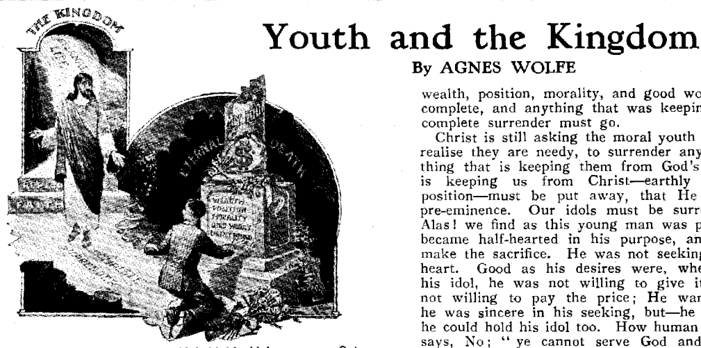
"He wanted Christ if he could hold his idol too. . . . But God says, No; 'Ye cannot serve God and mammon.'"

When a man tells you that he believes in a God too good to send people into everlasting punishment, tell him you believe in One who is too good to pen up saints and devils for ever together.