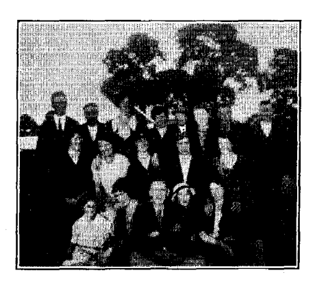
Band of Moneyslane and Rathfriland Elim Workers

ministry has been greatly blessed to the Lord's people, his expositions of Scripture proving most helpful to all. Studies on "The Baptism of the Holy Ghost"