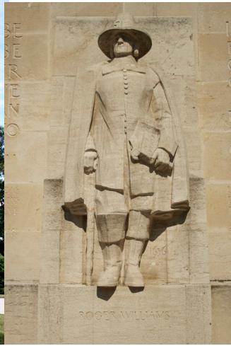
Statues of Roger Williams in Providence, Rhode Island (left) (the book in his left hand is titled Soul Liberty) and on the Freedom (Reformation) Wall in Geneva