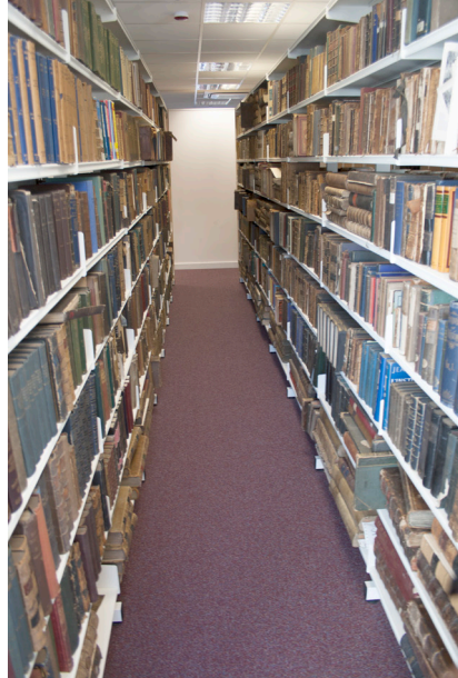
Book racking inside the new Evangelical Library