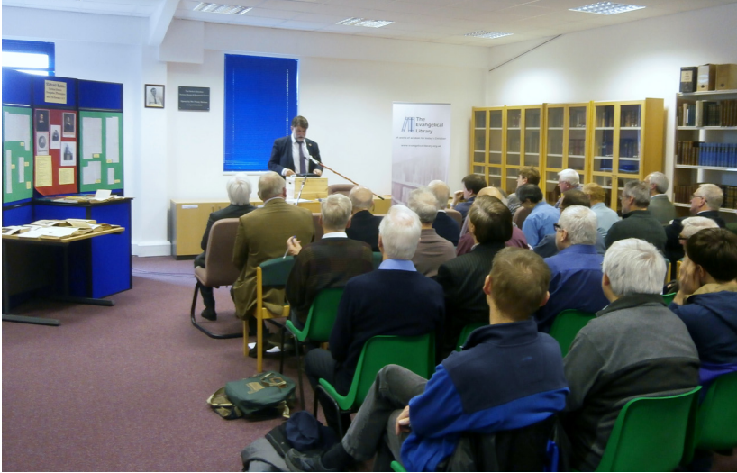
A lecture in the Evangelical Library

he thought too much of them. He realised their usefulness. He noted in his Diary on Monday 12 November 1855