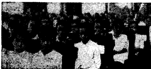
QUEENSTOWN SCHOOL, BRITISH GUIANA.

A new native catechist teacher has been appointed recently at our Mission Station in Guiana—at a salary of £30 a year. Promises to support him for 7, 10, 14, or 21 years are earnestly invited. We are anxious to see his work established on a firm basis.