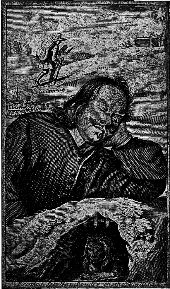
Frontispiece to the Third Edition of The Pilgrim's Progress , 1670.

"SLEEPING" PORTRAIT OF JOHN BUNYAN, BY ROBERT WHITE.