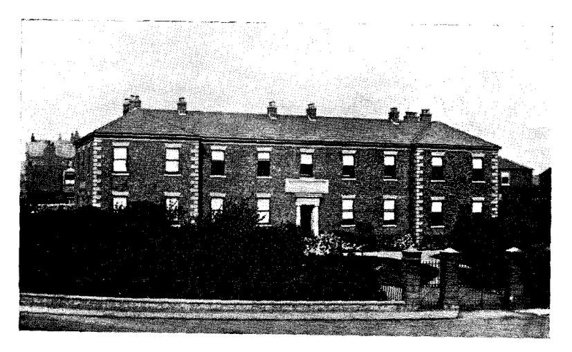
THE SUNDERLAND THEOLOGICAL INSTITUTION.