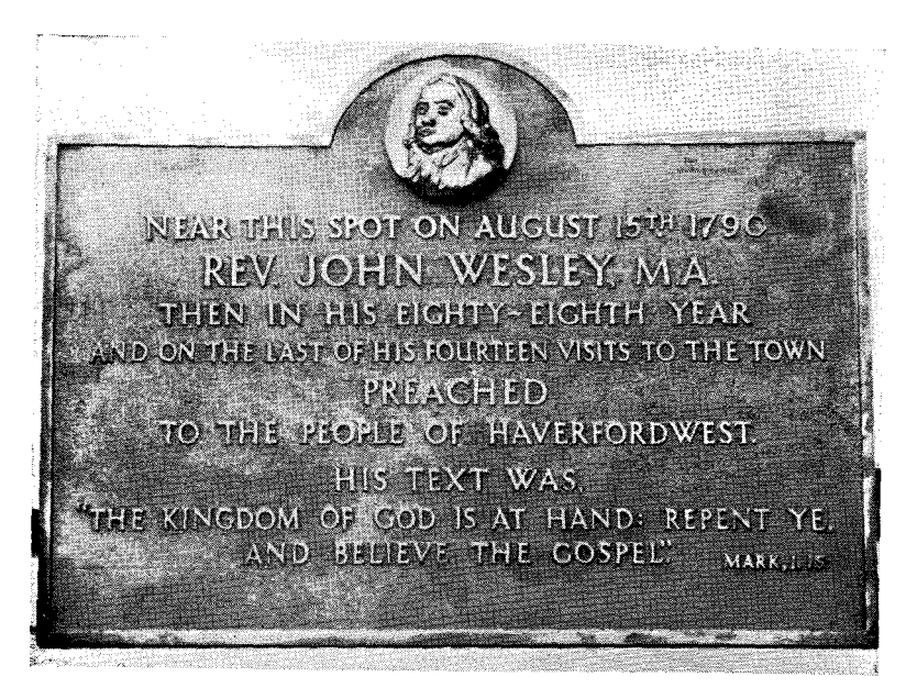
Commemorative Plaque unveiled at Haverfordwest on 18th May 1956.