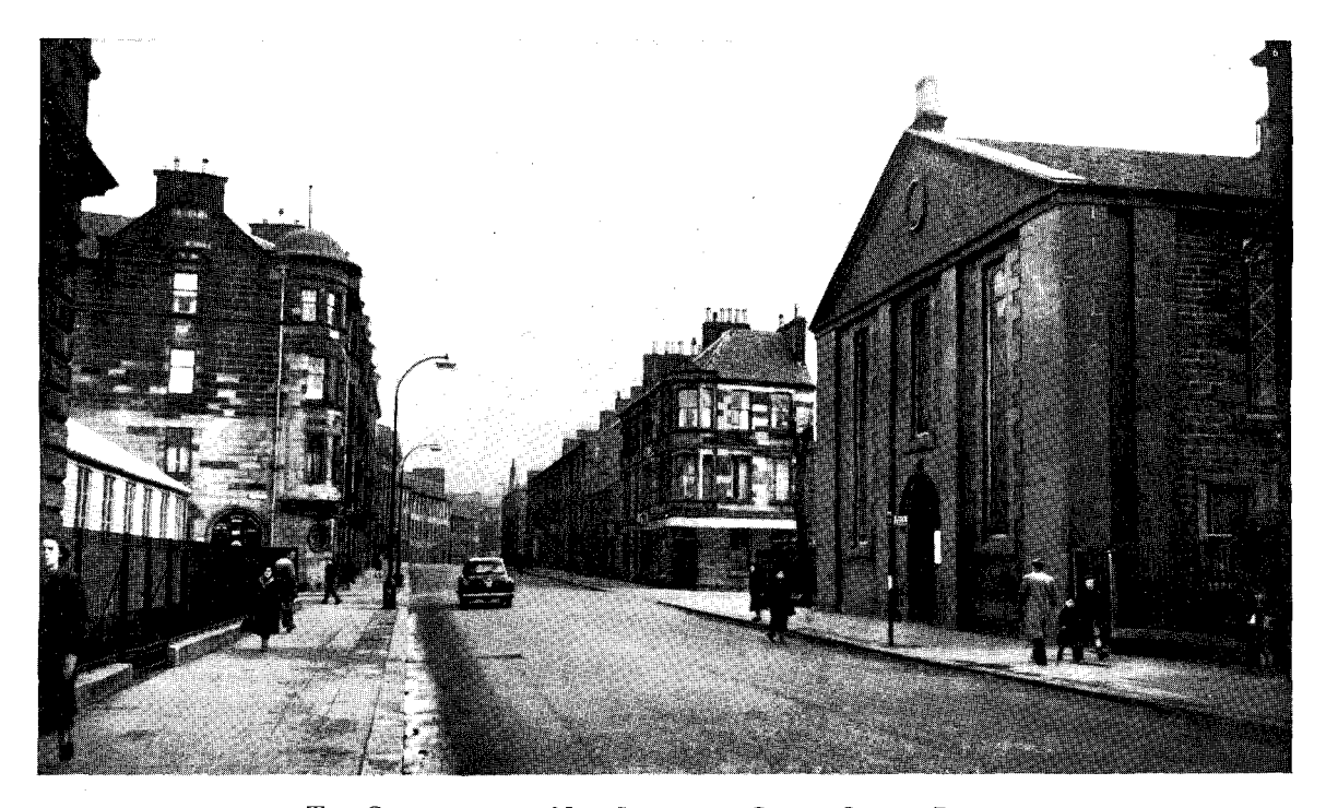
THE CHURCH OF THE NEW JERUSALEM, GEORGE STREET, PAISLEY.

Formerly used as a Wesleyan Methodist and later (until 1854) as a Wesleyan Association chapel. The right-hand side of the street is shortly to be demolished as part of a reconstruction scheme, but the church is to be allowed to remain.