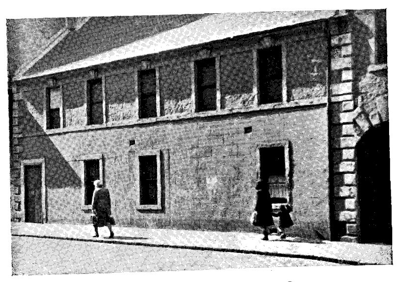
THE MASONS' LODGE, KING STREET, PORT GLASGOW. (The upper rooms are the Lodge rooms.)