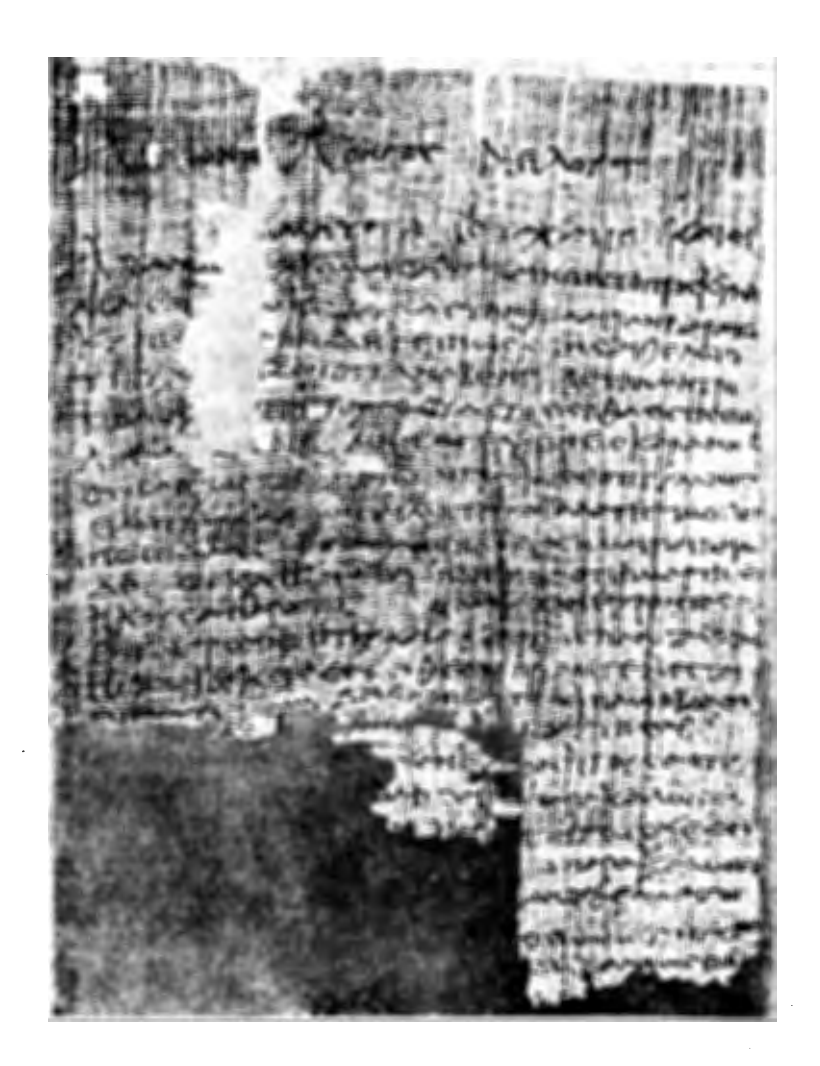
LETTER FROM A PRODIGAL SON TO HIS MOTHER, OF THE SECOND CENTURY A.D. See p. 71.

For the photograph from which this is produced we are indebted to the Director of the Royal Museums, Berlin, to whom our thanks are cordially extended.—Ed.