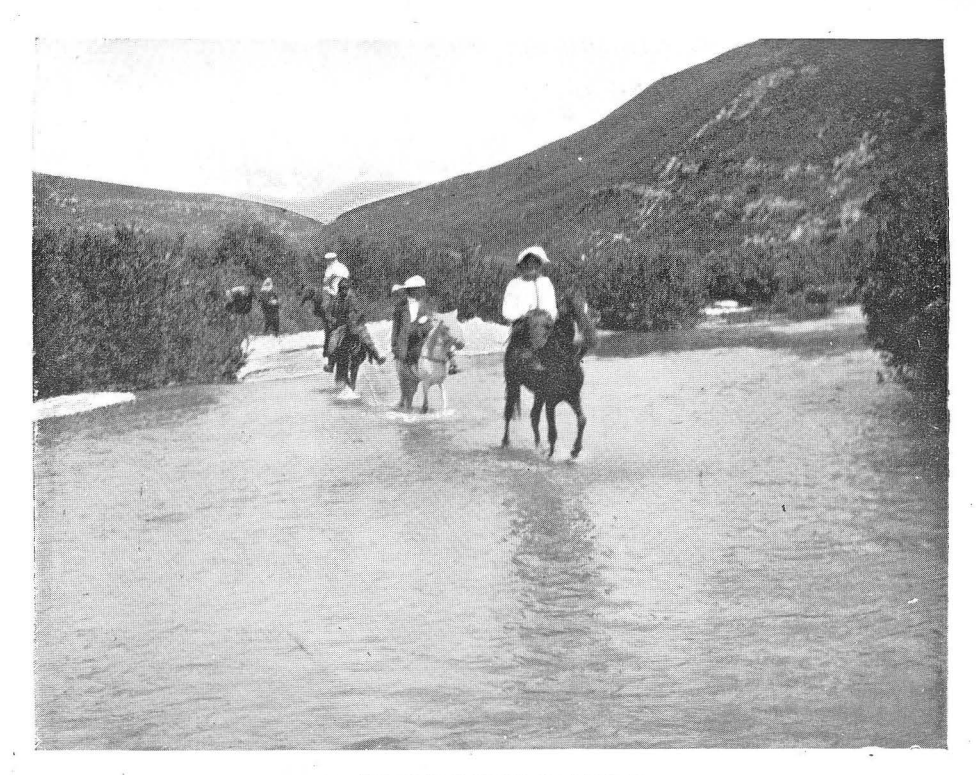
I .- FORDING THE RIVER JABBOK.