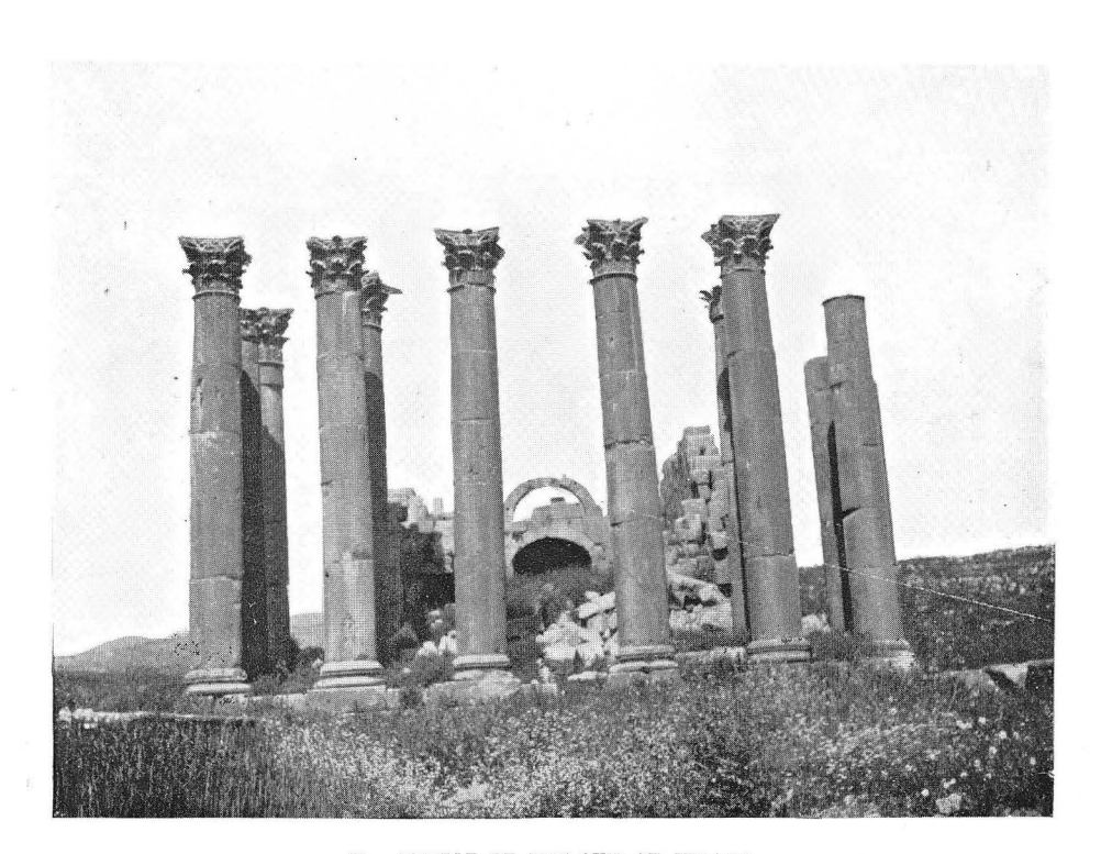
II.—TEMPLE OF THE SUN AT JERASH.