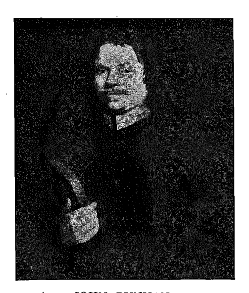
JOHN BUNYAN. OIL PAINTING BY THOMAS SADLER. [In the National Portrait Gallery, London.]