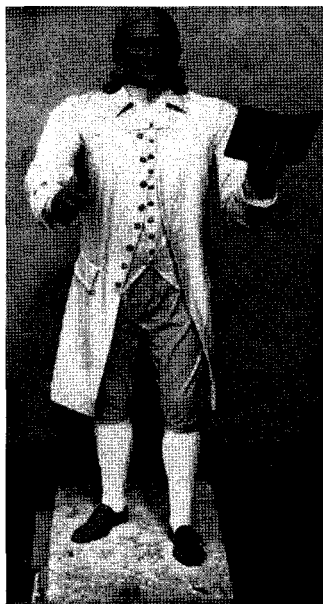
The Epworth Millennium/Tercentenary statue ready to be taken to the bronze works

Although the monument was never made, an enterprising but as yet unidentified Staffordshire potter around 1860 made in large numbers commemorative Staffordshire flat back ornaments in two sizes, based on the drawing of the proposed Epworth statue. The larger and more numerous ornament is 11 inches [27.9cm] high and 4 7 / 8 inches [12.2cm] wide. The smaller one is 10 1 / 8 inches [25.7cm] high and 4 1 / 2 inches [11.4cm] wide. The figure of Wesley is in the same pose as shown in