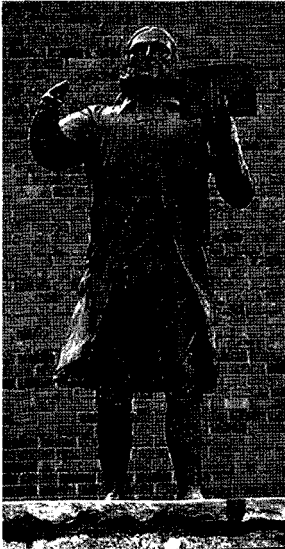
The Epworth Millennium/Tercentenary bronze statue 2003