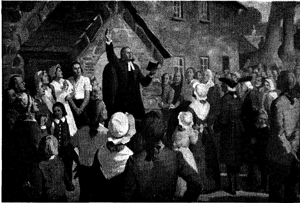
John Wesley preaching to Cornish “tanners” at Trewint.