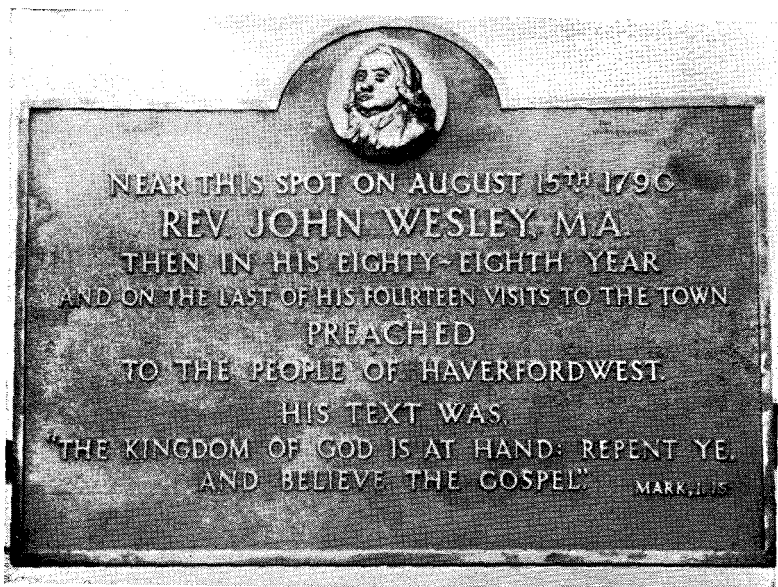
COMMEMORATIVE PLAQUE UNVEILED AT HAVERFORDWEST ON 18 TH MAY 1956.