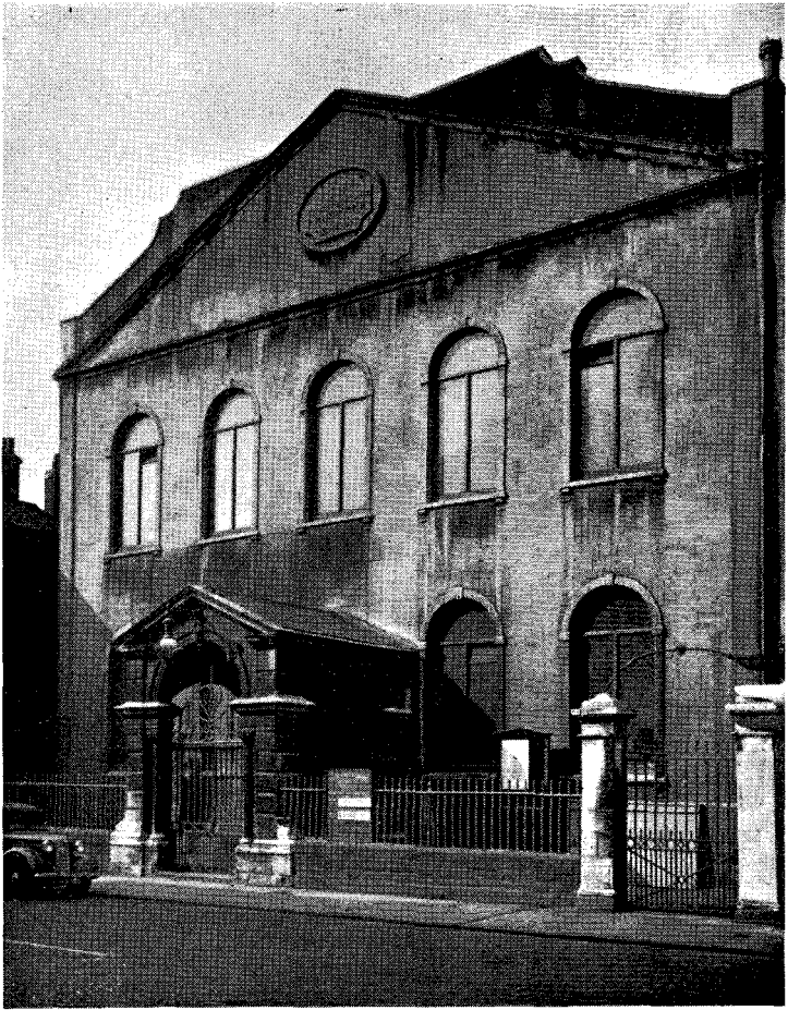
OLD KING STREET (EBENEZER) CHAPEL, BRISTOL: EXTERIOR.

Block kindly loaned by the trustees of Old King Street chapel, Bristol.