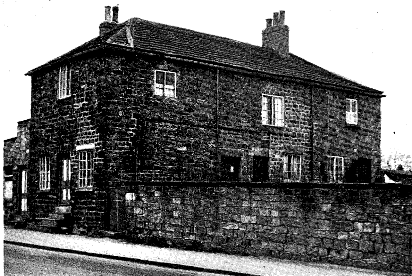
THE FIRST THORNER CHAPEL, BUILT c. 1762. (Now two cottages.)