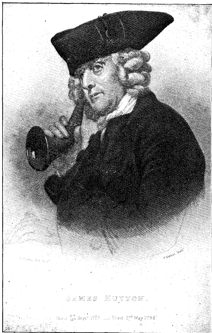
JAMES HUTTON. 1715—1795.

Engraved from Richard Cosway's painting, 1786.