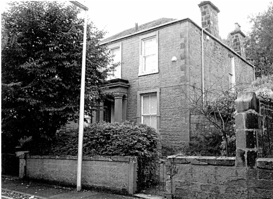
Fig. 4. The Thains' house at 2 Magdalen Place, Dundee.