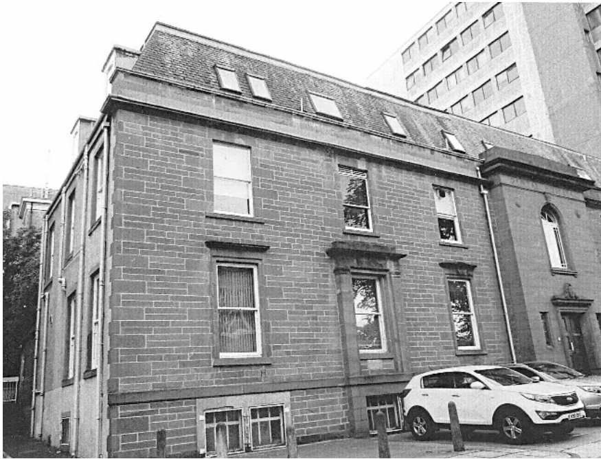
Fig. 1. The Thains' house at Park Place. The middle window on the ground floor replaces the entrance door, from which steps led to the ground level.