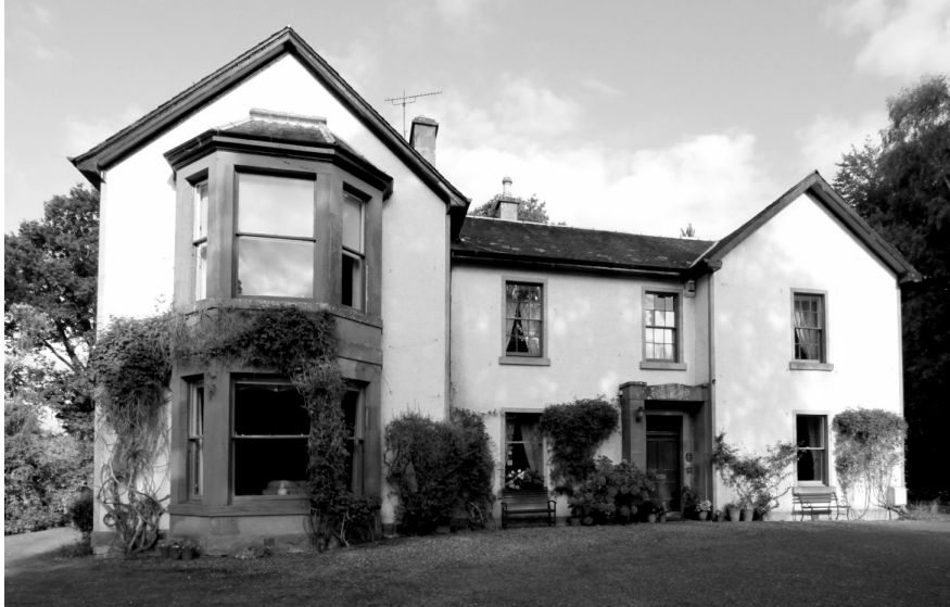
Fig. 3. Heath Park, Blairgowrie.

shortly after the death of his four-year-old son James, and built a large villa in extensive grounds: nineteenth century Ordnance Survey maps show trapezoidal boundaries approximately 220 yards by 265 yards (200 x 242 metres), an area just over 12 acres (4.85 hectares). The entrance lodge bears the carved date of 1838 but the date of building the villa (fig. 3) is not known with certainty. When the estate was sold by roup (public auction) in a Blairgowrie hotel in 1858, the house consisted of two public rooms, five bedrooms, two dressing rooms, kitchen and servants' apartment, pantries, store-closet, water-closet "&c". The offices [outbuildings] consisted of coach and car-house, stable, byre, and servants' room. "The garden is large and well stocked with fruit trees and bushes in bearing, and is enclosed with a wall." 96 This terminated the Thains' formal connection with Blairgowrie. Whilst Somerset's article was entitled "The Thains of Blairgowrie", 97 it should be noted that their intermittent residence in that locality lasted around twenty years and