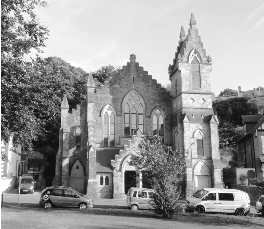
Fig. 6. St. Andrew's Presbyterian Church building, Torquay.

appointed as the assistant minister to Robert Forbes (1812-1859) 152 at Woodside, Aberdeen, at the end of 1847. During 1848 he became the Free Church Minister of Old Aberdeen where he ministered until 1861, when ill-health forced his resignation. He moved to Torquay for health reasons and became minister of St. Andrew's from 1863 to 1872, when once more he resigned for health reasons. 153 As the Thains resided in Torquay from 1868 (or earlier), it is therefore reasonable to conclude that he was the Thains' minister for the first part of their stay in the town.