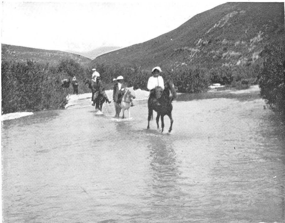
I.—FORDING THE RIVER JABBOK.