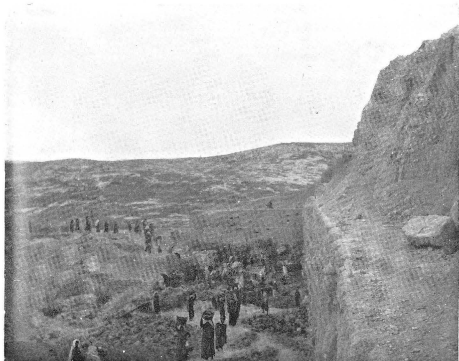
IV.—PROFESSOR MACALISTER'S EXCAVATIONS AT GEZER.