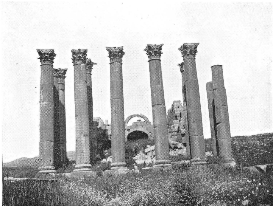
II.—TEMPLE OF THE SUN AT JERASH.