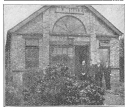
ELIM HALL, CARLTON.

A report of the work in this Nottinghamshire town appeared in last week's "Evangel."