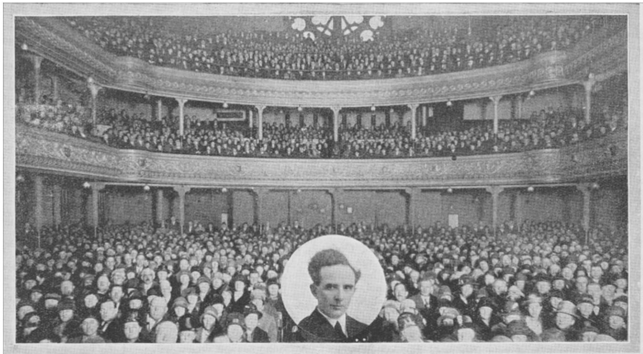
Back section of the Leeds Coliseum, showing the two galleries. Over 3,000 people listened attentively to the Foursquare Gospel at Pastor George Jeffreys' Revival Campaign. Hundreds were turned away. In two weeks over 2,000 professed conversion, and remarkable cases of healing took place (Inset: Pastor George Jeffreys)

One unshaven old man in the clothes of a tramp walked out murmuring, "Aye, but it's the real thing," and a fashion-