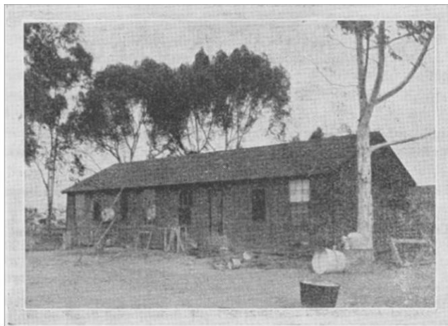
Some Mexican Homes

We feel that in the near future there will be a great turning to God on the part of the Latin American people, because numbers of Bible Students who are training in the Pentecostal Bible Schools