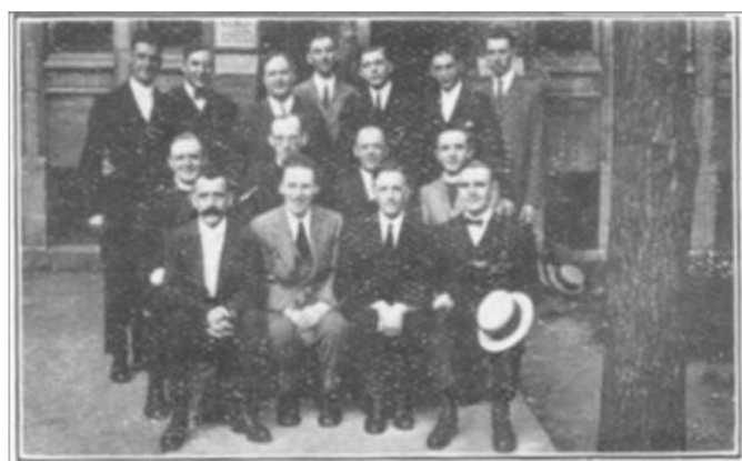
A Group including those ordained at the Annual Conference at Toronto.

Sweeter as the days go by, sweeter as the days go by, The Brethren's love is sweeter as the days go by.