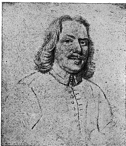
JOHN BUNYAN. VELLUM PENCIL DRAWING BY ROBERT WHITE. [Cracherode Collection, British Museum.]