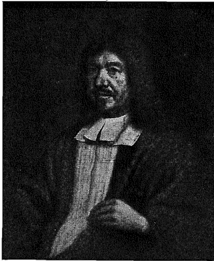
THE OIL PAINTING OF JOHN BUNYAN;

[From a photograph in the Bedford Public Library.]