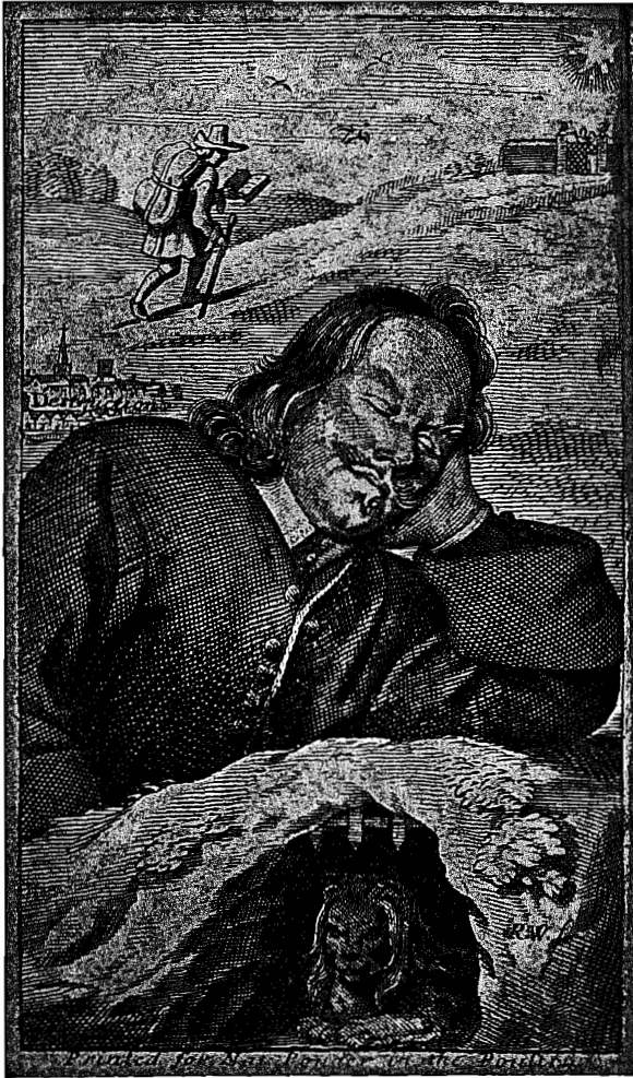
Frontispiece to the Third Edition of The Pilgrim's Progress , 1670.

"SLEEPING" PORTRAIT OF JOHN BUNYAN, BY ROBERT WHITE.