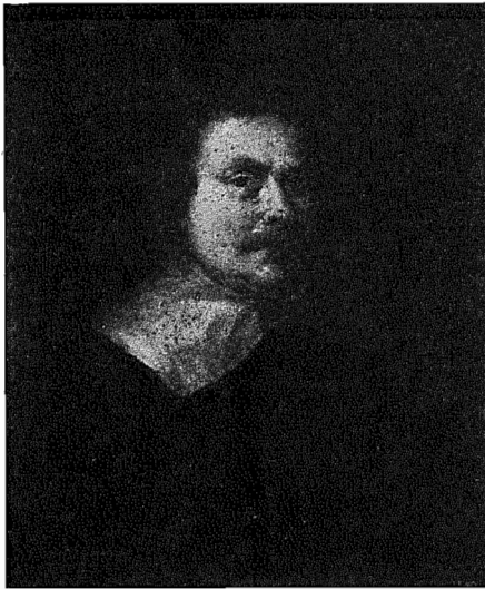
THE "PLIMPTON" PORTRAIT OF JOHN BUNYAN

[From a photograph in the Bedford Public Library.]