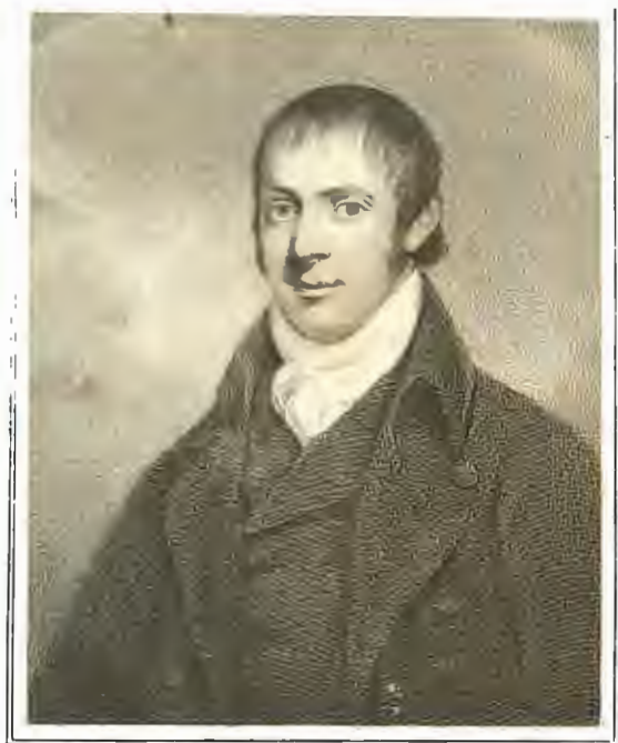
Rev. William Ward. Baptist Missionary at Serampore.

Published by Button & Son, Paternoster Row Oct. 1 st 1817.