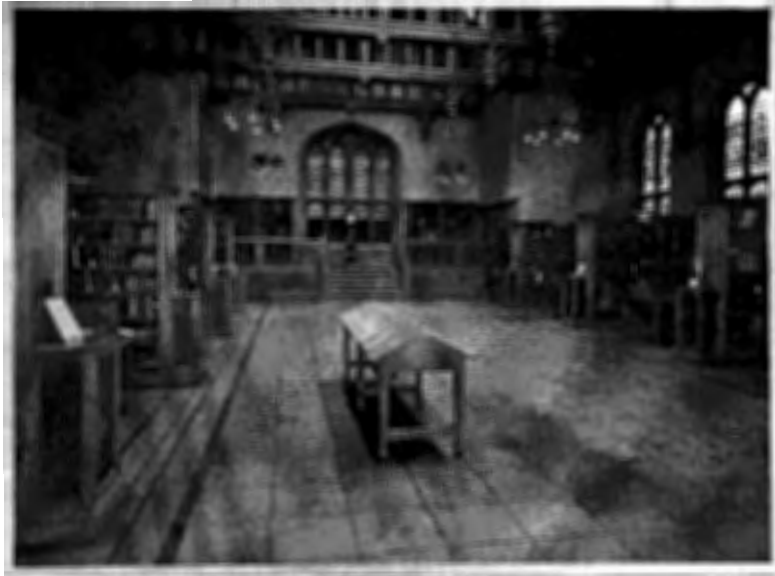
New College Library, 1946

University. It's a far cry from the first days of the library, when Hunter (1946: 196) described the early Reading Room as "most uncomfortable in its furnishings, and such a shivery place that few students frequented it". To see how the Library looks today, take the Virtual Tour available on the Library's website at http://www.lib.ed.ac.uk/resbysub/virtourdiv.shtml