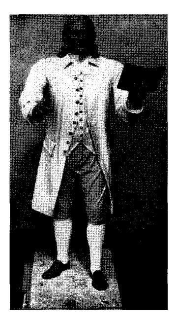
The Epworth Millennium/Tercentenary statue ready to be taken to the bronze works

Although the monument was never made, an enterprising but as yet unidentified Staffordshire potter around 1860 made in large numbers commemorative Staffordshire flat back ornaments in two sizes, based on the drawing of the proposed Epworth statue. The larger and more numerous ornament is 11 inches [27.9cm] high and 4^{7/8} inches [12.2cm] wide. The smaller one is 10^{1/8} inches [25.7cm] high and 4^{1/2} inches [11.4cm] wide. The figure of Wesley is in the same pose as shown in