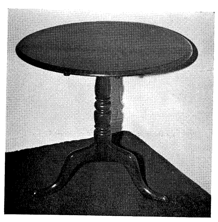
A WESLEY TABLE FROM WEDNESBURY. (See Notes and Queries No. 1224 on page 93.)