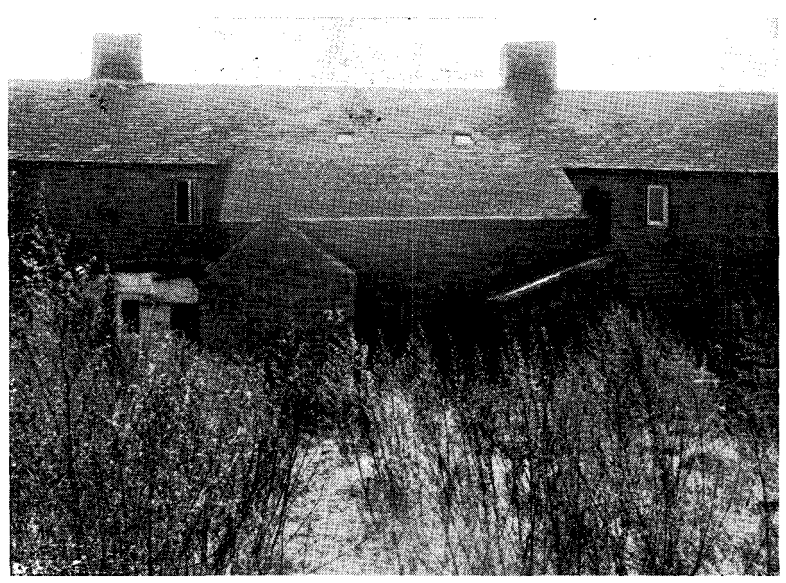
REAR OF NO. 25, PORTLAND ROW. The Chapel, of which only a part remained when this photograph was taken, originally extended a further 20 feet over the ground in the front of the picture.