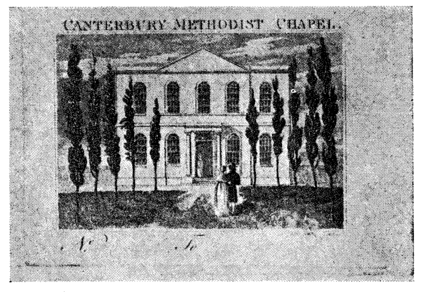
A Pew Ticket from St. Peter's Street Chapel, Canterbury (see p. 64)