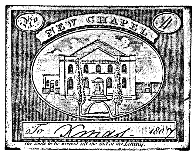
Two Pew Tickets from Wesley's Chapel, London (see p. 64)