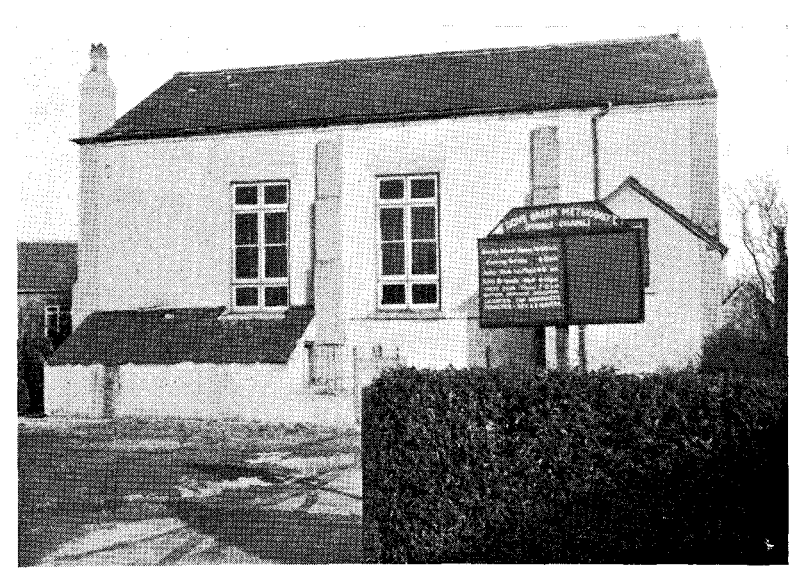
SELSTON "MIDDLE" CHAPEL.

Built by the Original Methodists in the autumn of 1839. Continued as Original Methodist until 1870, when it became United Methodist Free Church. Still in use today—the only chapel whose origin can be traced to the earliest days of the Original Methodist secession.