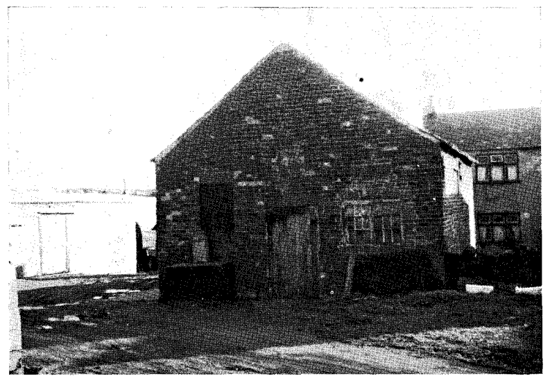
Selston Primitive Methodist Chapel (Belper Circuit). Built 1826. The church from which the Original Methodists broke away to build their own "Middle" Chapel. Demolished January 1966.