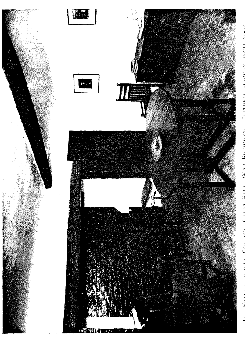
(Contemporary furniture given by the World Methodist Council. The sideboard, date 1780, was presented by the Foundery Church, Washington, D.C., which was dedicated by Bishop Asbury in 1814.) THE FRANCIS ASBURY COTTAGE, GREAT BARR, WEST BROMWICH, INTERIOR, SHOWING INGLE-NOOK