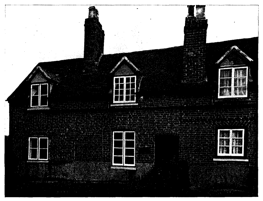
THE FRANCIS ASBURY COTTAGE, GREAT BARR, WEST BROMWICH (EXTERIOR). (The property to the right of the picture is part of the adjoining cottage.)