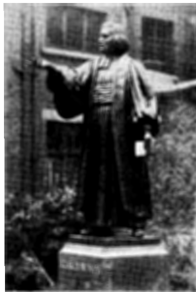
THE STATUE OF CHARLES WESLEY