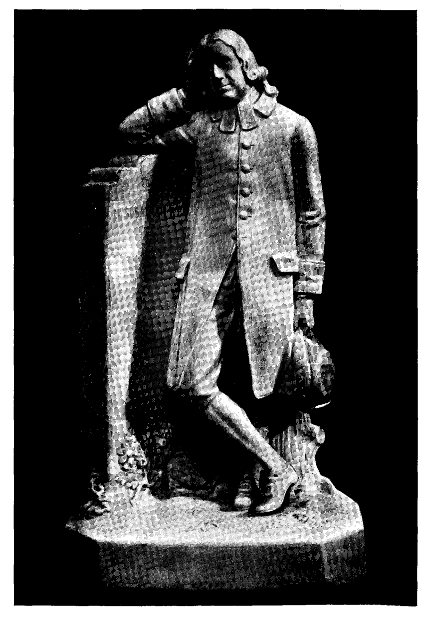
AN IRISH STATUETTE OF WESLEY