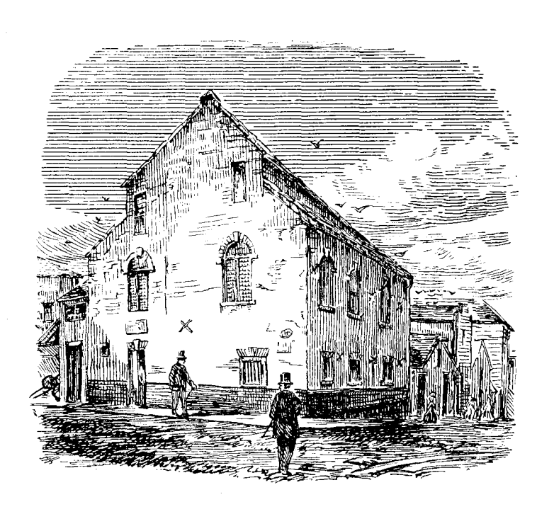
THE OLD METHODIST PREACHING HOUSE ST. MICHAEL'S LANE, DERBY.

The first Methodist Chapel erected in the Town or County.