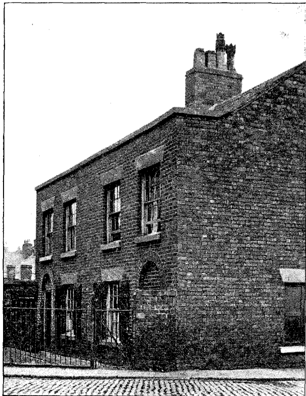
THE FIRST METHODIST CHAPEL IN WARRINGTON. c. 1770. NOW A COTTAGE.