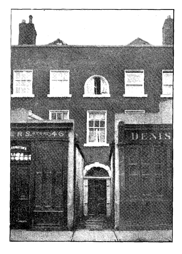
THE THOLSEL, KILKENNY.