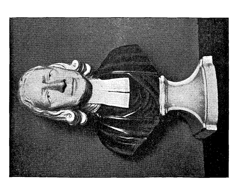
ENOCH WOOD'S BUSTS OF WESLEY: CLASS A, PRODUCED BEFORE WESLEY'S DEATH. 2. Back view.