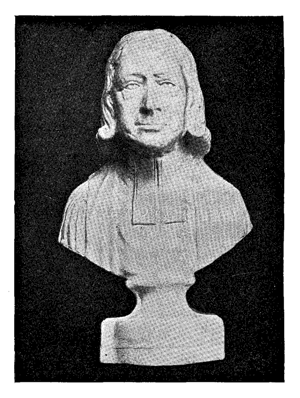
ENOCH WOOD'S BUSTS OF WESLEY: CLASS B, PRODUCED AFTER WESLEY'S DEATH.

3. With solid back, and date of Wesley's death.