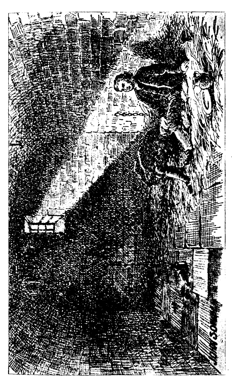
Pr permission of