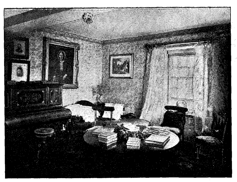
BARLEY HALL: ROOM IN WHICH WESLEY PREACHED.