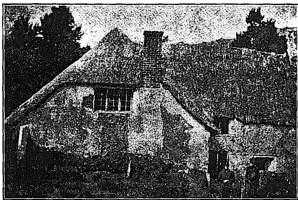
LOUGHWOOD IN DALWOOD, BUILT 1655.